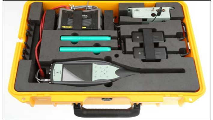
Fig. 3 Protective high-density machined foam inlays

The cases are light and robust, and their contents are secured in the case with high-density machined foam inlays. The cases are designed for unattended noise monitoring. They protect the measurement system from the weather and unauthorised access while providing power and remote data retrieval.