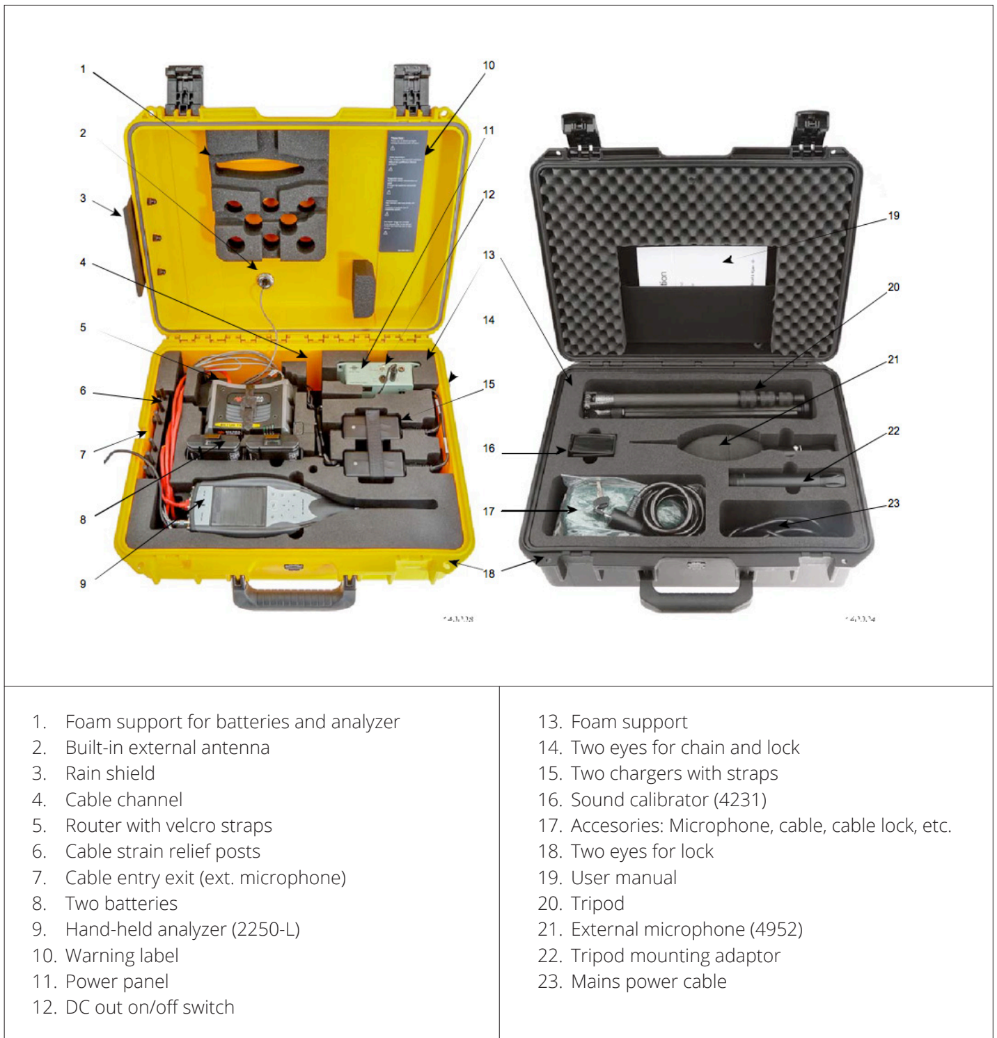
Fig. 2 The contents of the Portable NMT Type 3655-C-DMO