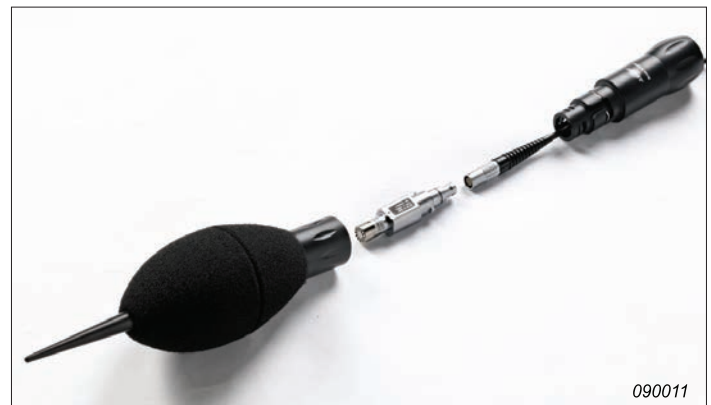
Fig. 4 Outdoor Microphone Type 4952 suitable for long periods of unattended monitoring

Type 4952 is recommended for extended use in all kinds of weather. Up to 100 m of microphone extension cable can be used while maintaining measurement accuracy. You can mount the microphone on the supplied tripod using Tripod Adaptor UA-1707 or on a 1 2 threaded pole.