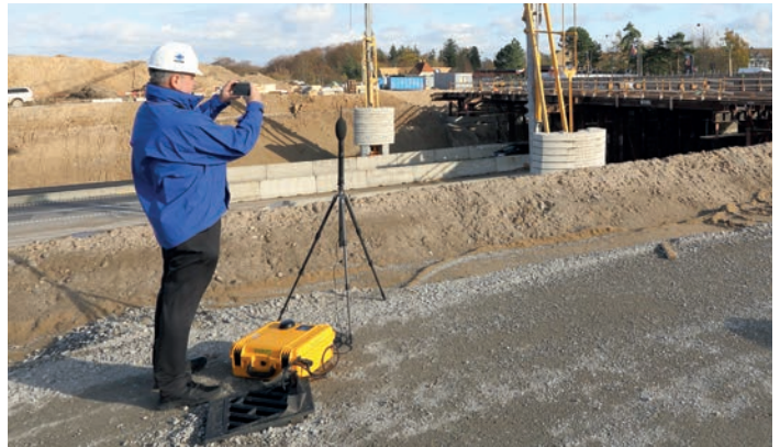
Fig. 1 Portable NMT in use on a construction site

Portable NMT Type 3655-C-DMO comes complete with tripod, router, SIM card and airtime contract, antenna, sound level calibrator and all accessories required for deployment. In addition, a smart phone App eases setup and configuration, including easy location based on GPS, as well as entering location notes and photographs. The NMT is delivered in two transport cases, one for deployment and one for the accessories. The NMT can operate off its own internal batteries for 32 hours (typical) with the router. In addition, it can operate off AC power or with external DC power.