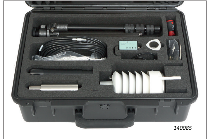
Fig. 5 Noise Sentinel On Demand Weather Station Kit MM-0256-A-DMO

The kit is delivered in a robust transport case that contains everything needed to set up the weather station in the field, including a tripod. Based on ultrasound, the weather stations operate silently, which allows close placement to the microphone position.